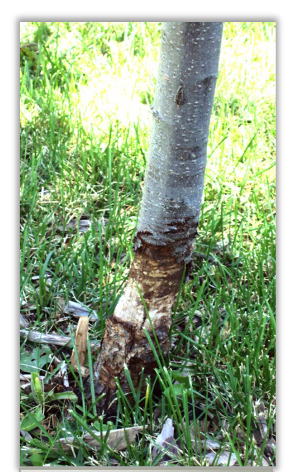
This tree has been completely girdled as a result of continual mower and string trimmer damage.

Contact Information: Phone: (307) 637-6428