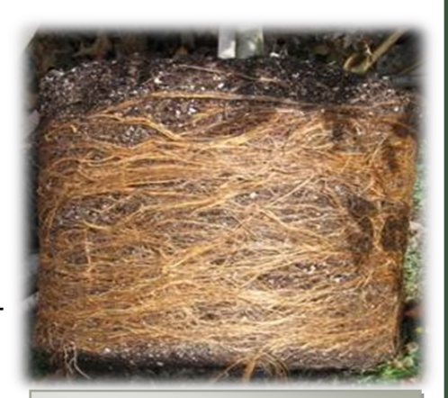
This potted tree has circling roots that must be cut prior to planting.

Plant At The Proper Depth — Plant the tree with the trunk flare just above the soil line. Planting trees too deep suffocates the roots and encourages circling roots.